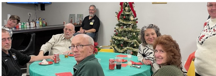
Pics from the festive and fun Knights Christmas Party!